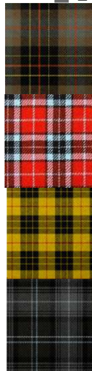
Brodie Hunting Weathered