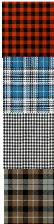
MacGregor Rob Roy Ancient